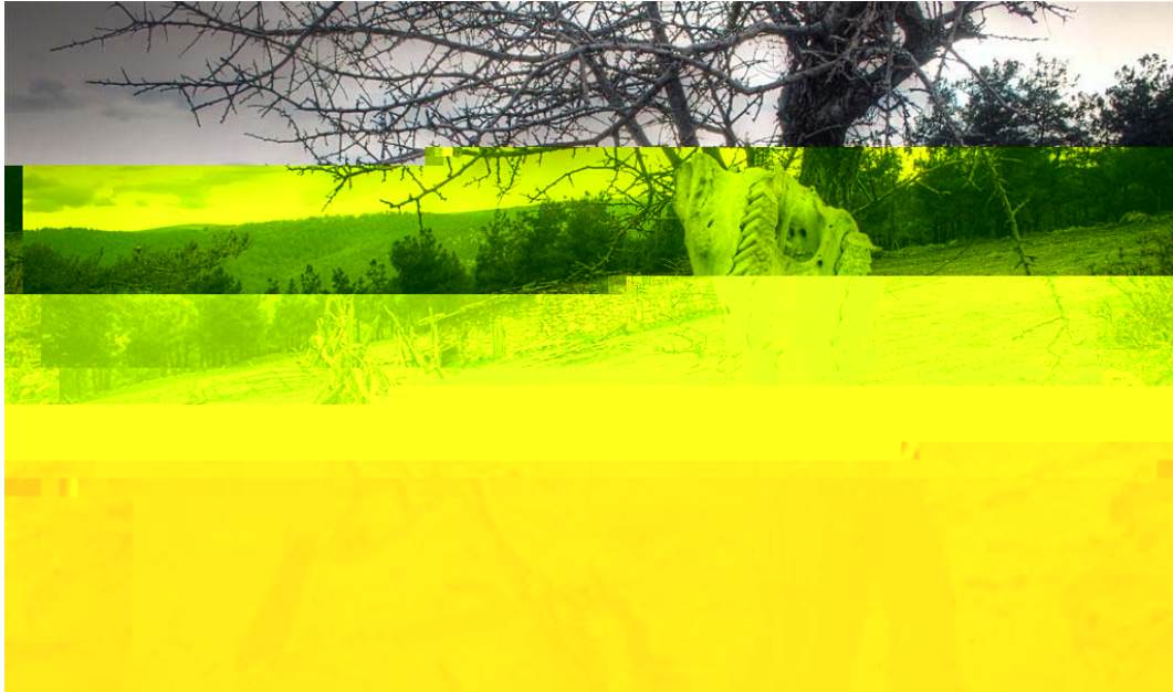
: ch fUZ`M`a`Uh?`5`M5` :- www.yilmazkaya.net

? UhU`ž? if[in]j Y6U`_i fhUFXUž`_“h`fi`\\UFUj YV`mĩmY`_Uf`i`h`i`g`a`c`UFU`_Uhi`_UZUg` _i`U`b`X`_`Uf`_V`]ba Y`h`X]f`"6U`_i fhUfžUhmWUfi`_cj Ub`Uf`ib`b`Yf`Uz`b`U`X`Už`Uf`i`g`_a`Ug`b`U`_Uf`i` Uh`_UZUg`i`mY`Y`h`fa ] ž`_Uhi`_`Uf`_X]`_a ] `Y`X]f`" ? i`n`Ym`? UZ`Ug`n`U`V` `[Yg]`H`f`_`Yf]`X`ž`h`fia` ~f`b`Yf]b]`_cfi`a`U`], ]b`h`f`U`f`ib`U`U`h`_UZUg`i`mY`Y`h`f]`a ]`_Uhi`_`Uf`_X]`_a`Y`h`X]f`Yf`"